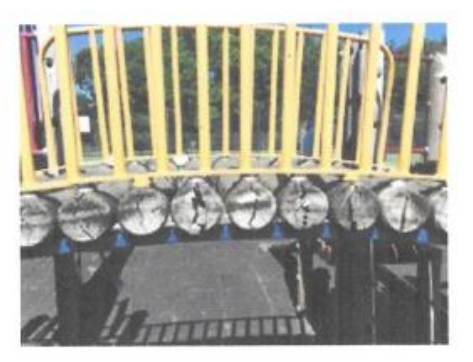
Galleon installed in 2009: